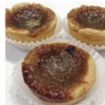
RAISIN BUTTER TART