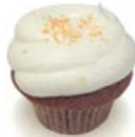
14 KARROT GOLD

decadent chocolate buttercream with vanilla cake