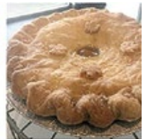
9" FRUIT (double crust)