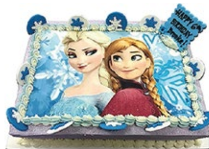
Slab Edible Image

edible image will cover 75% of cake, top and bottom border, inscription on cake board