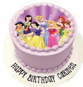
Round Edible Image

edible image will cover 75% of cake, top and bottom border, inscription on cake board